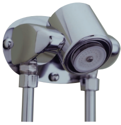
Pontiac 2000 Two-pipe Shower Suitable for exposed and concealed pipe work connections.

Legal Considerations; The Health & Safety at Work Act etc, 1974.