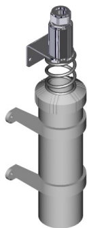
Air-gap Arrangement Tuntube and Purge-cycle controller; guard fitted.